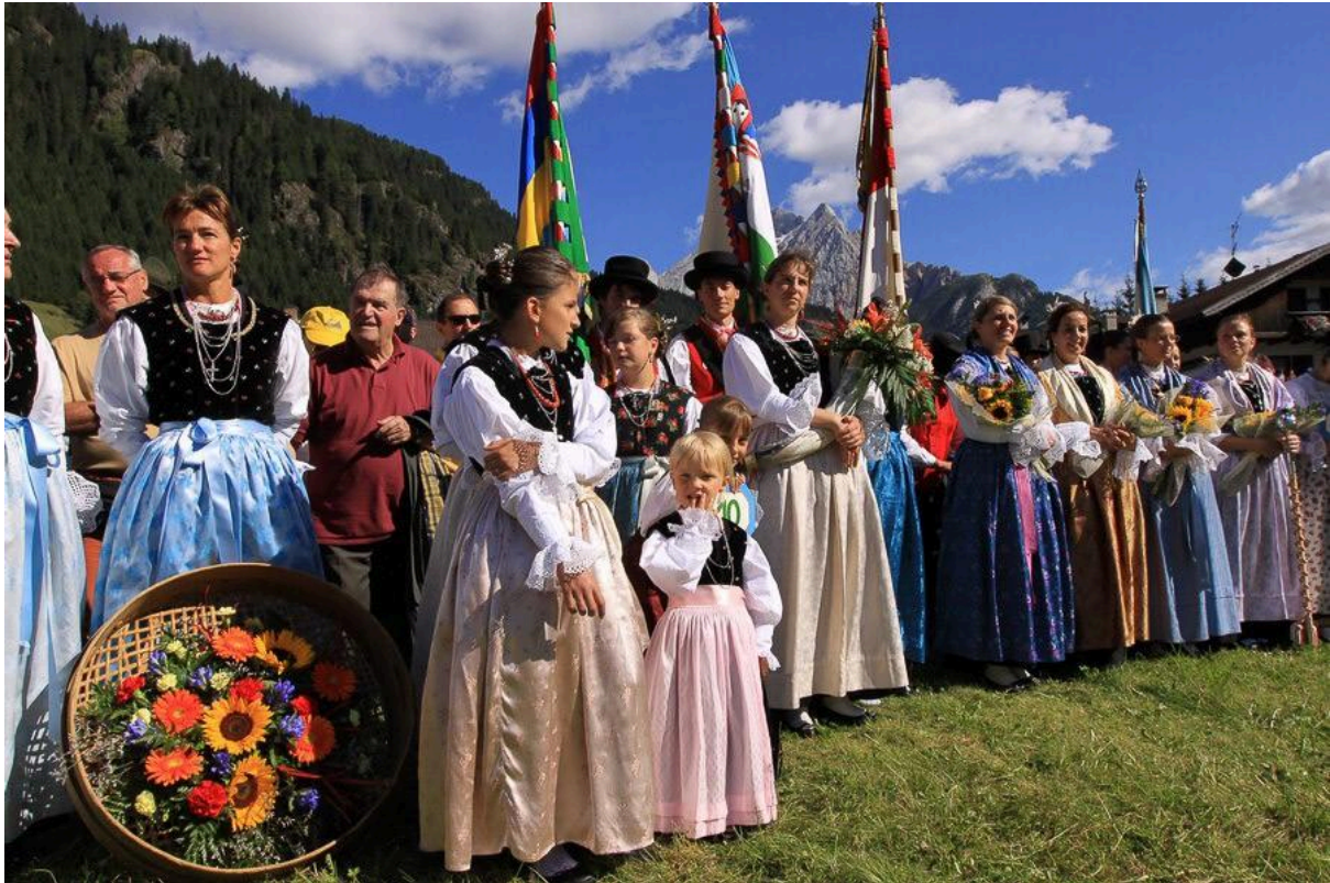
Traditional female Ladin costumes of Fassa Valley. In Copyright. Photo by Anton Sessa in the Ladin Calendar 2010. Ladin Cultural Institute. Istitut Cultural Ladin, "majon di fascegn".

The project will collaborate closely with representatives from the Sámi, the Jewish and the Ladin people, ensuring their direct participation.